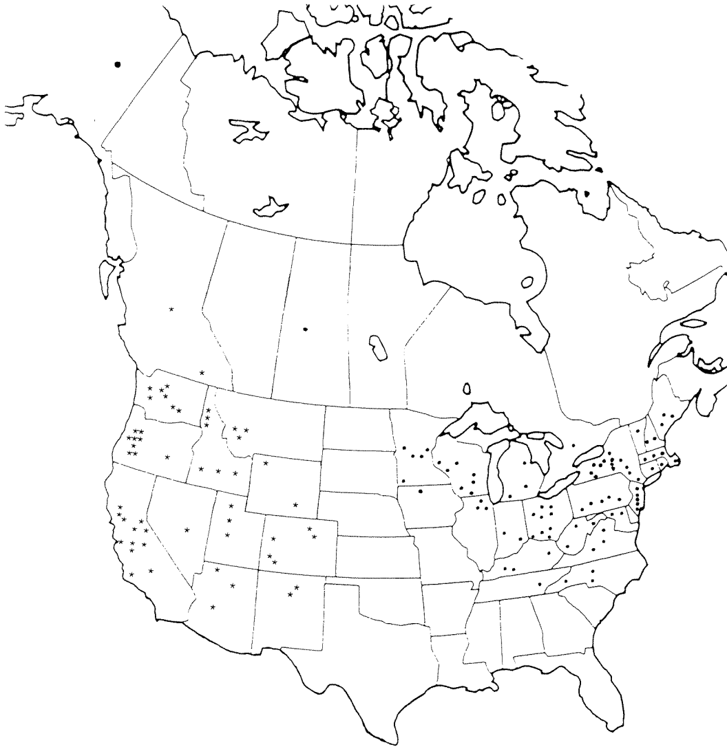
Fig. 1. Distribution of Protocalliphora sialia (●) and P. occidentalis (★) in North America.

males have a dull, microtomentose preocular area. Only the eastern form of P. sialia puparia had been studied at that time and ultimately P. sialia was left as one species, pending future research. The purpose of this study is to determine the status of this diverse, widespread species.